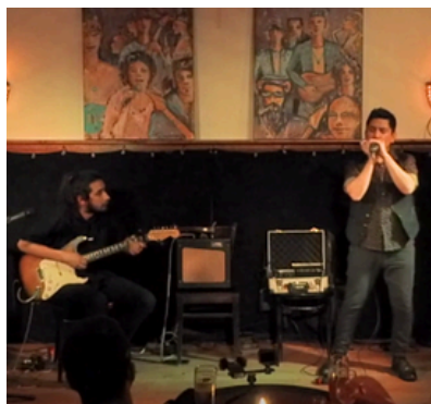
DÚO LIVE SHOW SWART BERLÍN 2023