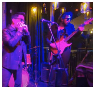
LA LUNA EN TU MIRADA (EN VIVO)