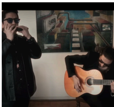
NO SOY DE AQUÍ