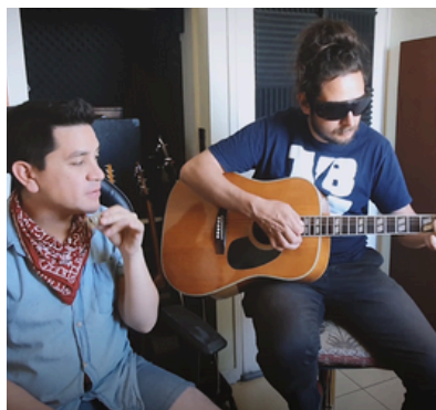
BLUES SHUFFLE ACOUSTIC