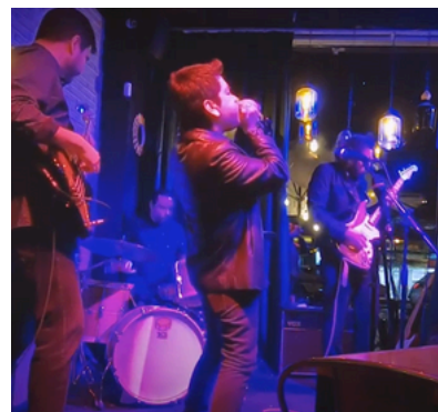
BALADA A LOS RECUERDOS (EN VIVO)